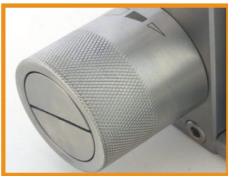
Graft Thickness Adjustment