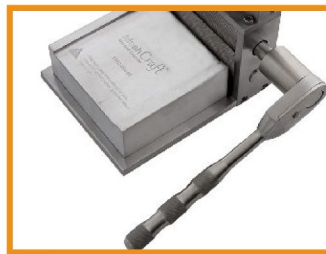
Ratchet Handle for Easy Operation